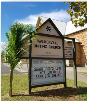
Church sign for Palm Sunday